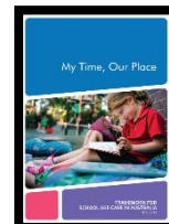
My Time, Our Place; Framework for School Age Care in Australia 2022 V2

Critical reflection: is a meaning-making process that assists informing future practice in ways that demonstrate an understanding of each child’s learning, development and wellbeing and implications for equity and social justice. It involves examining and analysing events, experiences and practices from a range of perspectives to inform future planning and decision-making ( Early Years Learning Framework 2022 V2 – refer to Sources ).